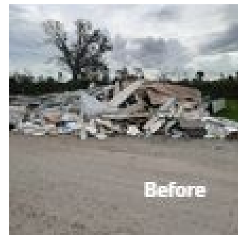
Saturday October 22nd: ML Corp. removed the mountain of debris removed location of future courts 3 & 4