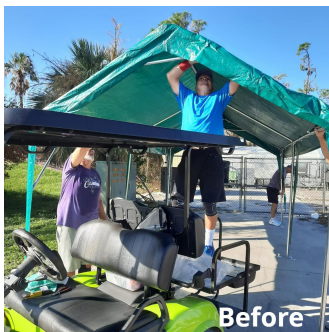
Monday October 17th: another great group of members installed the sunshade. Looks great, and provides some much need shade.